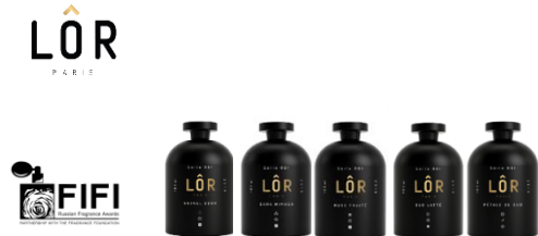
LABScent Animal Doux, Dark Mimosa, Musc Fruité, Oud Latté, Pétale De Oud