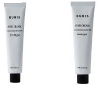
LABScent Jazz Night, Amorgos