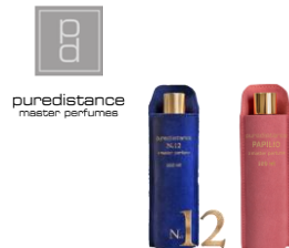
LABScent N0.12, Papilio