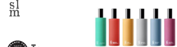
LABScent THE FRAGRANCE FOUNDATION UK AWARDS WINNER Odisiaque, Vapeurs Diablotines, Cuir d'Orient, Essence, du Sérail, Fontaine Royale, Poudre Impériale