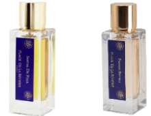
Santal de Paris, Passion Riviera