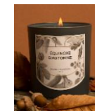
LABScent Equinoxe d'Automne