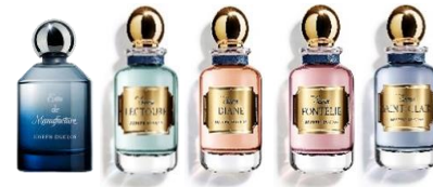
LABScent Eau de Manufacture, Source Lectoure, Source Diane, Source Fontélie, Source St Clair