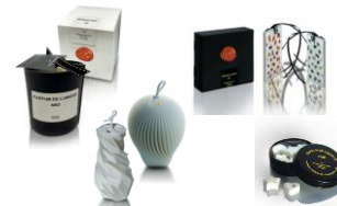
LABScent NBD BOUGIES Collection senteur TULUM