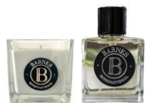
LABScent Barnes International Realty