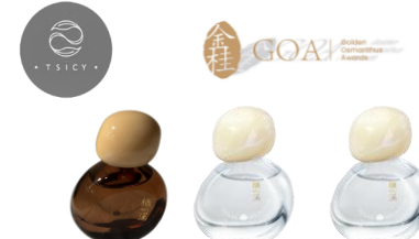
LABScent Thé chaud Maple, Peilan Revenue, Jasmine Heart