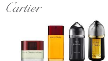
Must pour Homme, Must pour Femme, Pasha Black Edition