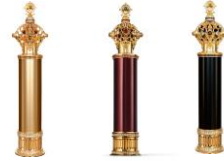
Richness, Glory, Power