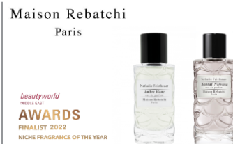
LABScent Ambre Blanc, Santal Nirvana