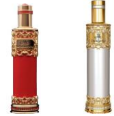
Red Hot Carnaval, Indulgence