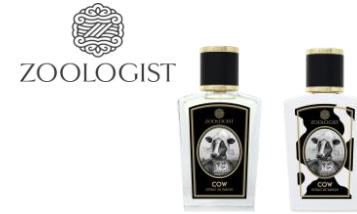
LABScent Cow, Cow Special Edition