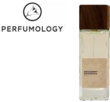
LABScent Decadent Memories