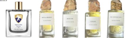
LABscent Saphir du Bois, RICH as CROESUS, Rose Taif, Cerasus, S'il Vous Plait