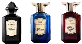
LABscent Taboo, Silence, Wild Night