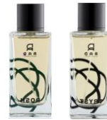
LABscent Posh, Tryst