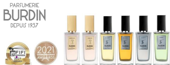
LABScent Emmène-moi, Soir d'Or, En Garde! Sans Témoïn, Amoroso, Carrure