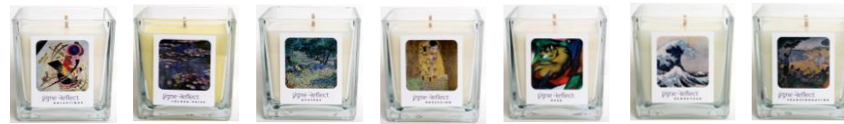
LABScent Galactique, Lâcher – Prise, Mystère, Obsession, Oser, Renouveau, Transformation