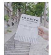
LABScent Respire Montmartre Parfum Lilas