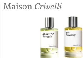
LABScent Absinthe Boréale, Lys Solaberg