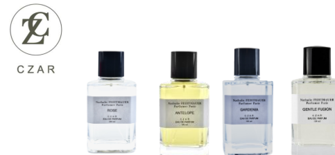
LABScent Rose, Antelope, Gardenia, Gentle Fusion