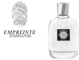
LABScent Nuit de Lune