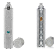
LABscent Silenda d'Ecume, Utaki Sacré