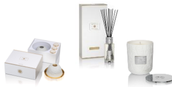
LABScent Silenda d'Ecume Kadoo Collection