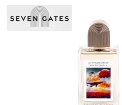
LABScent AI Fragment