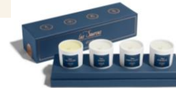
LABScent Les sources, collection 4 bougies parfumées