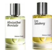
LABScent Absinthe Boréale, Lys Solaberg