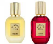
LABScent Paris chéri, Madame M