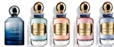
LABScent Eau de Manufacture, Source Lecture, Source Diane, Source Fontélie, Source St Clair