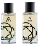
LABScent Posh, Tryst