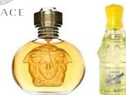
Blonde, Yellow Jean