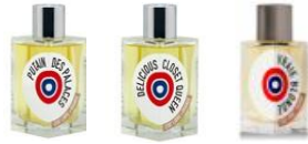
Putain des palaces, Closet Queen, Nombriil immense