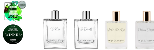
LABScent Be Rosy, Be Earnest, Vanilla Rum Royal, Pistachio Delight