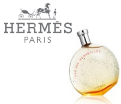
Eau des Merveilles, with Ralf Schwieger