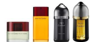
Must pour Homme, Must pour Femme, Pasha Black Edition