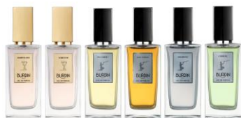
LABScent Emmène-moi, Soir d'Or, En Garde ! Sans Témoïn, Amoroso, Carrure