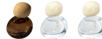
LABScent Thé chaud Maple, Peilan Revenue, Jasmine Heart