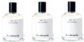
LABScent ODR-213 Opaque, ODR-212 Florescent, ODR-211 Lucent