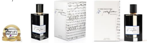
LABScent Electro Limonade, Mono Cachemire