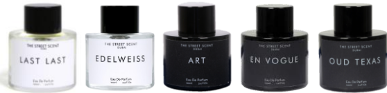
LABScent Last Last, Edelweiss, Art, En Vogue, Oud Texas