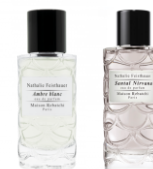
LABScent Ambre Blanc, Santal Nirvana