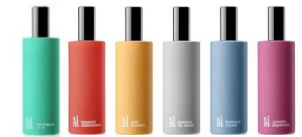
LABScent Odisiaque, Vapeurs Diablotines, Cuir d'Orient, Essence, du Sérail, Fontaine Royale, Poudre Impériale