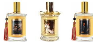
LABScent Cuir Cavalier, L'Aimée, L'homme aux gants,