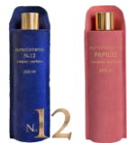
LABScent NO.12, Papilio