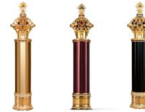
Richness, Glory, Power