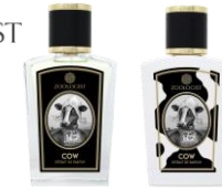
LABScent Cow, Cow Special Edition