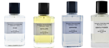
LABScent Rose, Antelope, Gardenia, Gentle Fusion