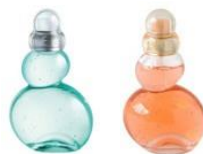
Eau Belle, Orange Tonic