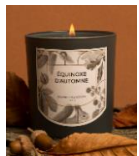
LABScent Equinoxe d'Automne