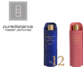
LABScent NO.12, Papilio