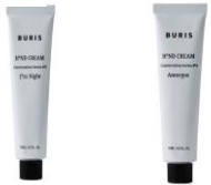
LABScent Jazz Night, Amorgos