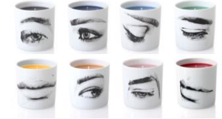
LABScent La Mystique, L'Adorable, La Sublime, La Délicate, La Timide, L'Irrésistible, La Gourmande, L'Elégante