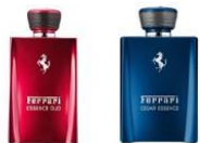
Oud, Cedar Essence