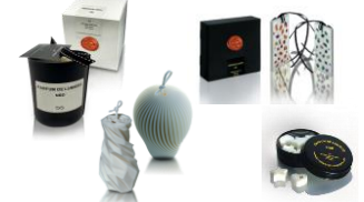
LABScent Collection senteur TULUM