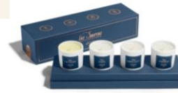
LABScent Les sources, collection 4 bougies parfumées