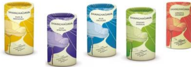
Blue Orchidée, Ananas Impérial, Lilas Spiritual, Ginger & Coconut, Musc & Patchouli

crazylibellule and the poppies PARFUMS PARIS