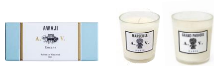
LABScent Awaji Incense, Marseille, Grand Paradis