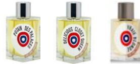
Putain des palaces, Closet Queen, Nombriil immense