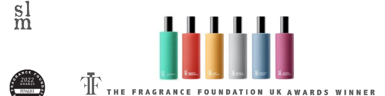
LABScent Odisiaque, Vapeurs Diablotines, Cuir d'Orient, Essence, du Sérail, Fontaine Royale, Poudre Impériale