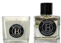
LABScent Barnes International Realty