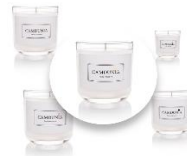
LABScent Paris, Varsaw, Dubai, Colombo, Denpasar, Christmas