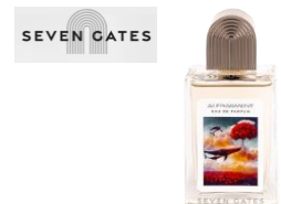
LABScent AI Fragment