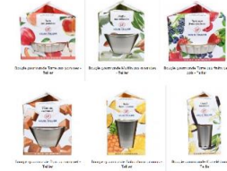
LABScent Tartes aux pommes, Muffin aux amandes, Fruits des bois, Caramelaba, Rhum Ananas, Cannelé Bordelais