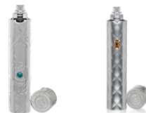
LABScent Silenda d'Ecume, Utaki Sacré