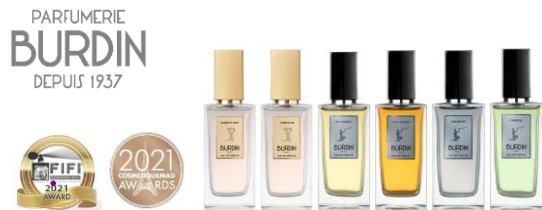
LABScent Emmène-moi, Soir d'Or, En Garde! Sans Témoïn, Amoroso, Carrure