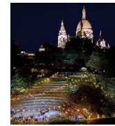
Arène de Montmartre Opéra 2019