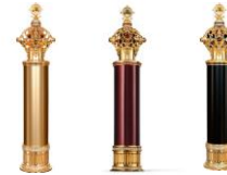
Richness, Glory, Power