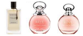
Gardénia Pétale Collection Extraordinaire, Réve, Réve Elixir