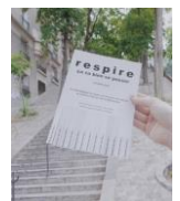
LABScent Respire Montmartre Parfum Lilas