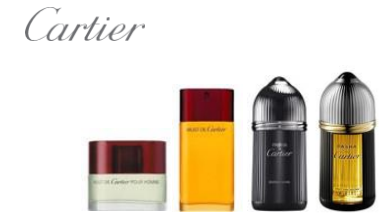
Must pour Homme, Must pour Femme, Pasha Black Edition