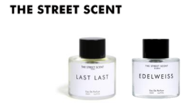
LABScent Last Last, Edelweiss