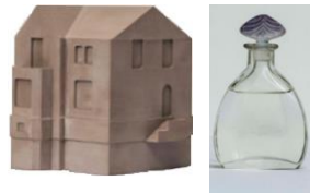
Olfactif de la maison de Paulette Moppert « L'occupante »