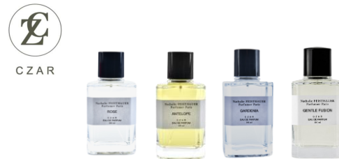
LABScent Rose, Antelope, Gardenia, Gentle Fusion