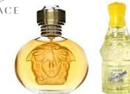
Blonde, Yellow Jean