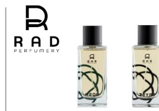
LABScent Posh, Tryst