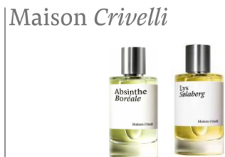
LABScent Absinthe Boréale, Lys Solaberg