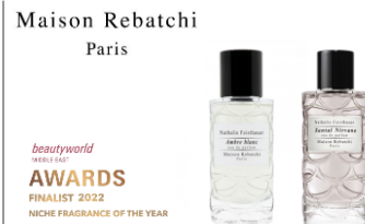
LABScent Ambre Blanc, Santal Nirvana