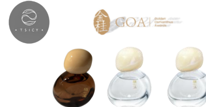
LABScent Thé chaud Maple, Peilan Revenue, Jasmine Heart