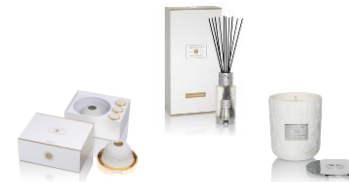
LABScent Silenda d'Ecume Kadoo Collection