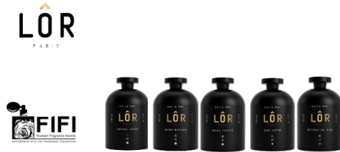
LABScent Animal Doux, Dark Mimosa, Musc Fruité, Oud Latté, Pétale De Oud