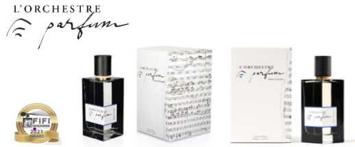
LABScent Electro Limonade, Mono Cachemire