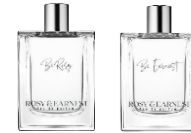
ROSY & EARNEST