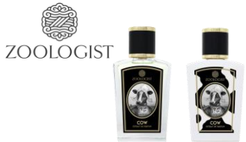
LABScent Cow, Cow Special Edition