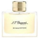
58, Avenue Montaigne