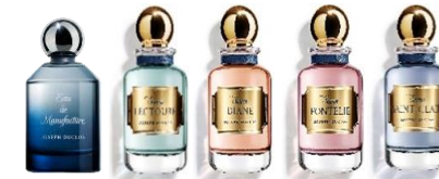
Eau de Manufacture, Source Lecture, Source Diane, Source Fontélie, Source St Clair