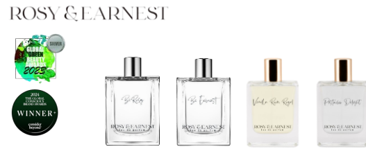
LABScent Be Rosy, Be Earnest, Vanilla Rum Royal, Pistachio Delight