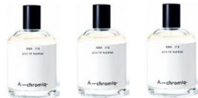
ODR-213 Opaque, ODR-212 Florescent, ODR-211 Lucent