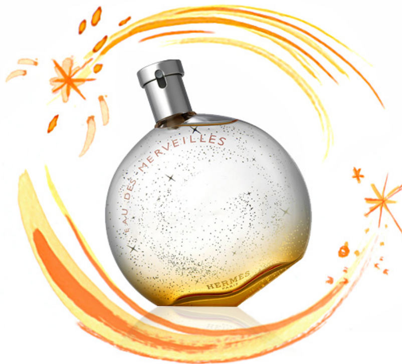
Desired Constellation – Eau des Merveilles by Hermès

“For women who dream with their eyes wide open and see stars in daylight.”